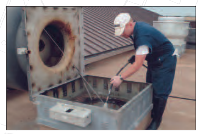
Spraying from roof down, no leaks below.