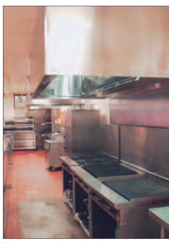
Fifteen new hoods were installed.