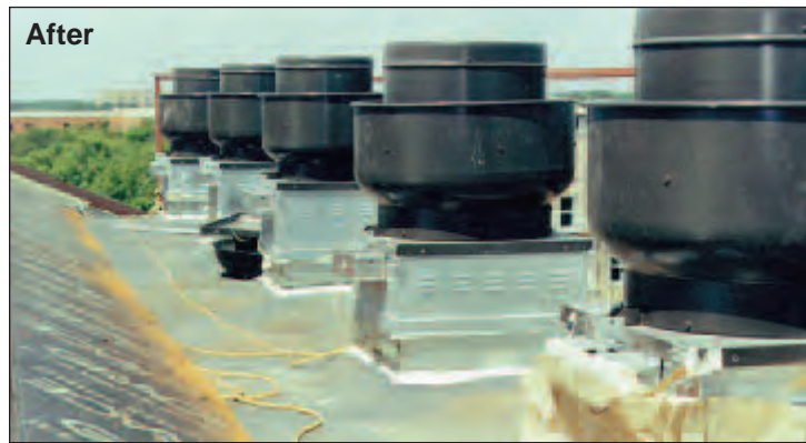
Three large exhaust fans were replaced with multiple smaller fans to serve several smaller cooking and serving stations. This allowed more efficient use, but required multiple duct installations and penetration through already congested areas.

See SBCCI PST & ESI Report no. 9666, BOCA Evaluation Services Inc. Research Report no. 96-37, and ICBO Evaluation Service Inc. Evaluation Report No. ER-5301 for allowable values and/or conditions of use concerning material presented herein.