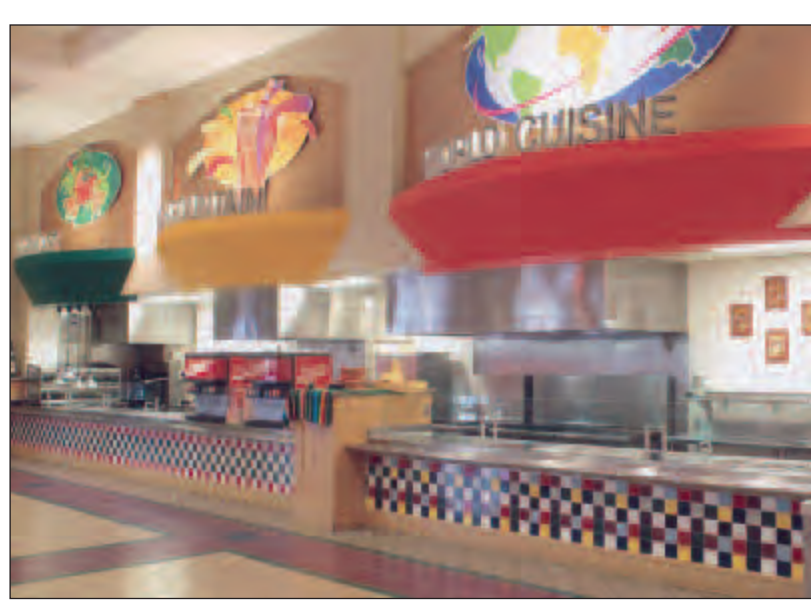
Sbisa offers a wide variety of cuisine.

The key renovation of the kitchen and foodservice area demanded attention from campus administrators, engineers, maintenance personnel, architects, and contractors. A master plan began in 1997, with construction starting in December, 1999.